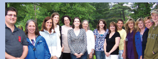
above, Chapter Planning Meeting; far left, Annual Golf Tournament; left; Heart & Soul Music for Marfan