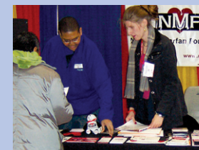
NBC4 Health & Fitness Expo, left NMF Lobby Day, below